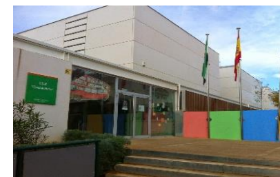
CEIP BILINGÜE CIUDAD DE MÉRIDA

ERASMUS+ KA219 PROJECT STRATEGIC PARTNERSHIPS FOR SCHOOLS ONLY (2017-2019)